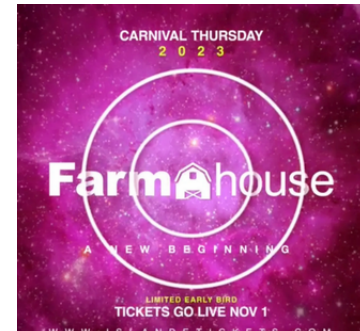
Farmhouse, Chaguaramas - February 16, 2023