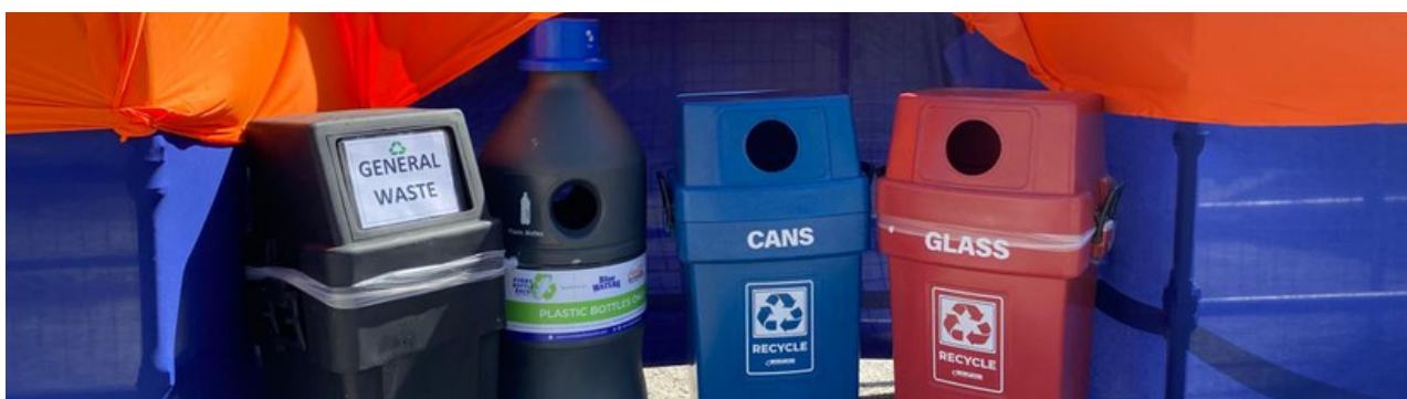
Our recycling collection bins prominently displayed at HADCO's Evening of Celebration

Are you a fete promoter or event organizer? Would you like to learn more about how we can help you create a more sustainable experience for your patrons? See the next page for our contact info to get in touch with HADCO's Recycling Division.