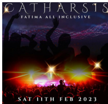
Fatima All Inclusive, Mucurapo - February 11, 2023