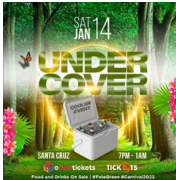
Undercover, Santa Cruz - January 14, 2023