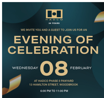
HADCO's Evening of Celebration, Woodbrook - February 8, 2023