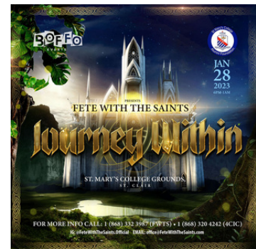
Fete with the Saints, St. Clair - January 28, 2023