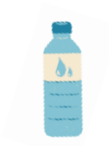
Single-use plastic water bottles

You can drop off the following household items: