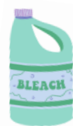
Plastic bottles of bleach and detergents