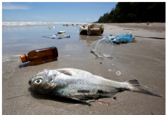
Fish washes up on a polluted beach