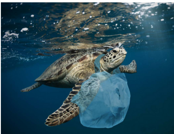
Sea turtle trapped in a plastic bag

Apart from being an eyesore on our coastlines, marine life can often mistake plastics for food and become trapped. Plastics can also damage the underwater habitats of marine animals; all of which have dire consequences for the survival and well-being of our oceans.