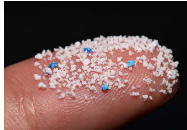
Microplastics can range anywhere from centimetres to millimetres in size

Humans who eat the flesh of fish or shellfish that have consumed the plastic also cannot process and digest the microplastic. This can lead to irritation and inflammation of the stomach, as well as numerous other health conditions.