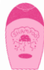
Shampoo, conditioner and liquid soap bottles

Please ensure that your waste plastics are dried and placed in a sealed bag. View our drop-off points on the following page.