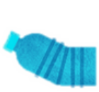
Polyethylene terephthalate (PET) Water bottles, dispensing containers, biscuit trays

Here is a list of the plastics most frequently found in the ocean due to waste mismanagement: