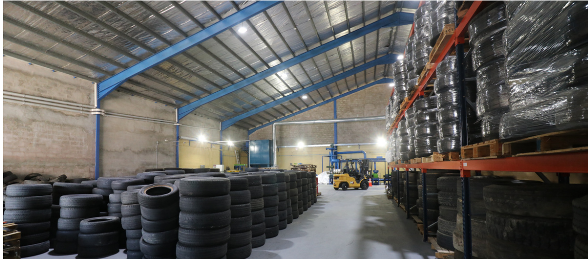
The used tyre storage bay in our Freeport warehouse.

Located in Freeport, our facility houses machinery to extract steel wire, as well as shred and grind the tyres into various sizes. These products can be used as raw materials for new steel wire, and rubber-based products.