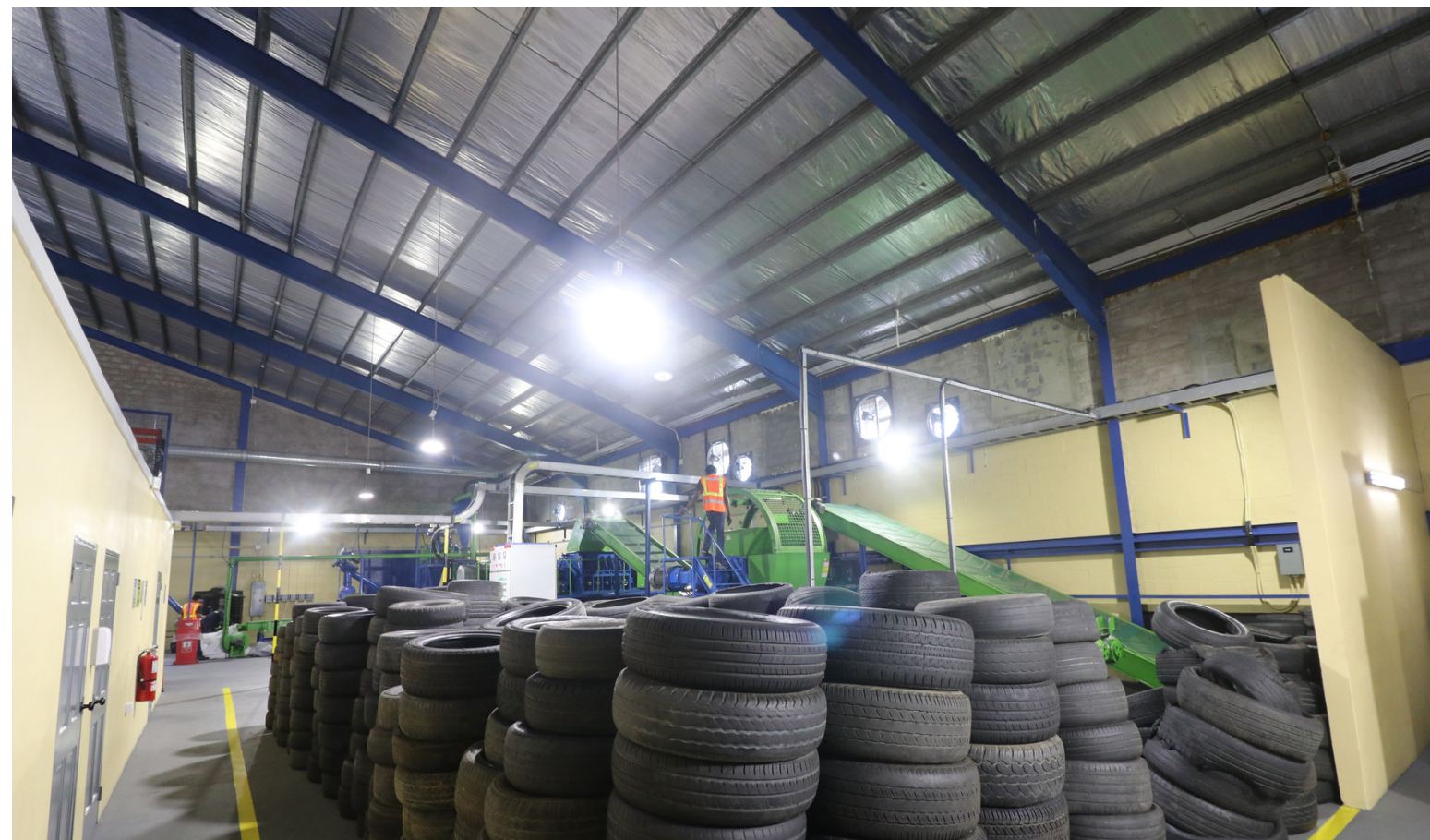
Used tyres waiting to be loaded on the shredder conveyor belt

Ecoimpact Tyre Recycling Facility - Unit 6, FWC, Rajkumar Trace, Freeport Village, Freeport.