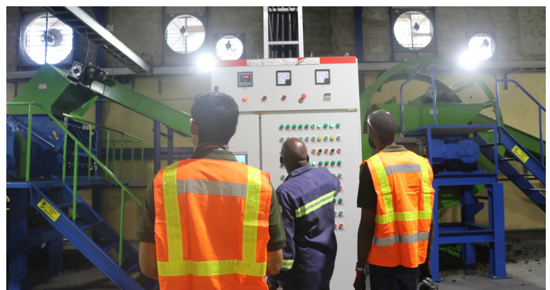
Employees diligently operate the tyre-shredding machinery