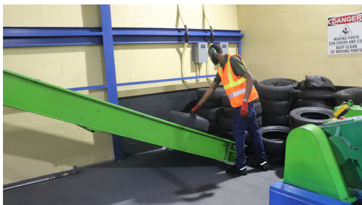
One of our employees loads a tyre onto the shredder belt