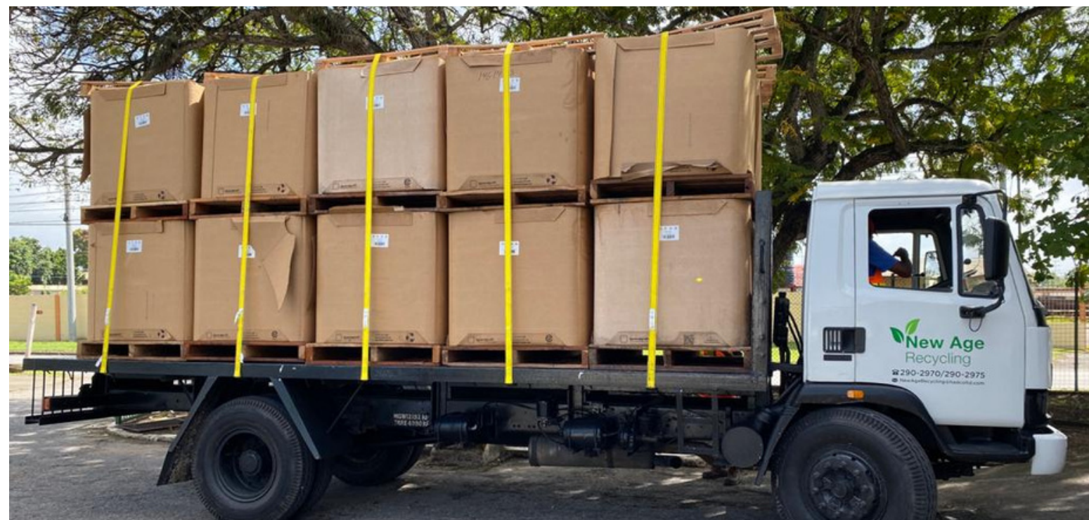
Our New Age Recycling collection truck ready to serve Trinidad and Tobago

For inquiries about waste vegetable oil (WVO), used lead-acid batteries and end-of-life tyres, please contact Ecoimpact Company Limited at (868) 633-3609 / 673-4395 / 5172 or email ecoimpact.info@hadcoltd.com .